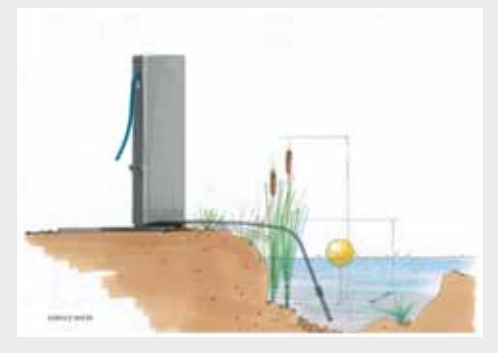
VILLAGEPUMP 500 Standard for surface water and storage tanks.